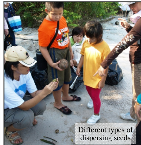
Different types of dispersing seeds

Both adults and kids showed much curiosity in learning the coastal animals and plants. They observed everything carefully and took a lot of photos as souvenirs! While exploring the local biodiversity, the importance of mangrove forests in ecological, physical and economical aspects was highlighted.