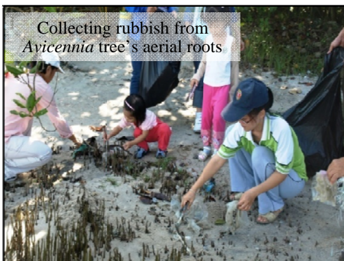
Collecting rubbish from Avicennia tree's aerial roots

The participants had seen all kinds of marine debris stranded along the shore during the guided tour. Thus, after enjoying the nature beauty, it was time to do some cleaning job. Every participant, no matter young or old, was dedicated to clean up the beach. Lots of non bio-degradable garbage such as plastic bags, fish nets and food packaging were found within mangrove tree roots (pneumatophores). As a result of the hard work, the participants have successfully collected 26 kg rubbish from the shore.