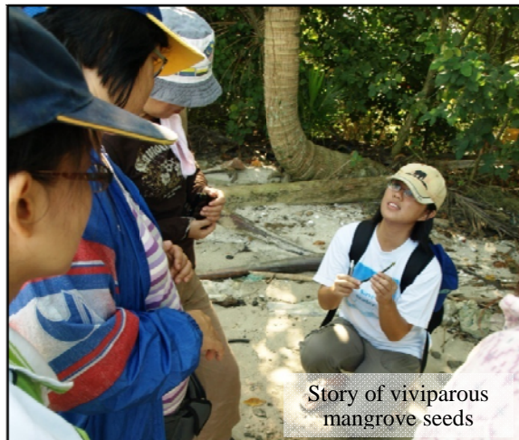
Story of viviparous mangrove seeds

The participants visited the coastal mangrove area which located around Kuala Pulau Betong or Pulau Betong river mouth. With the guidance of Ms. Wong, they were exposed to various plant and animal species that possess unique behaviours and characteristics as their adaptations to harsh intertidal environment.