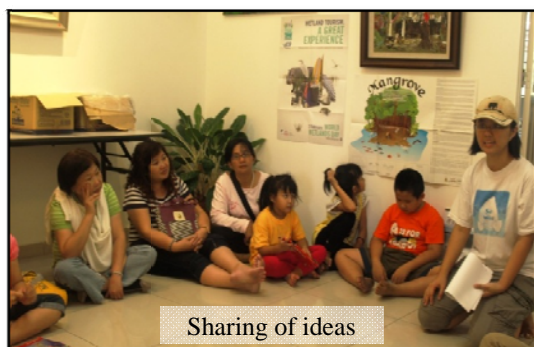
Sharing of ideas

Subsequently, it was a special activity of WWD celebration where the participants were provided with some materials (selected from the Ramsar Secretariat's