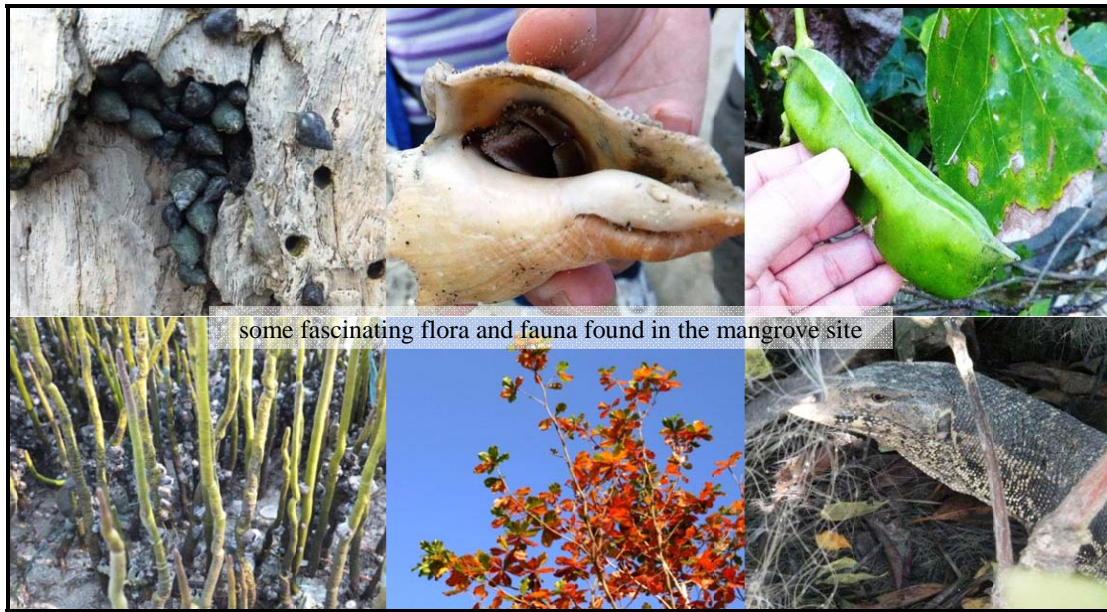
some fascinating flora and fauna found in the mangrove site