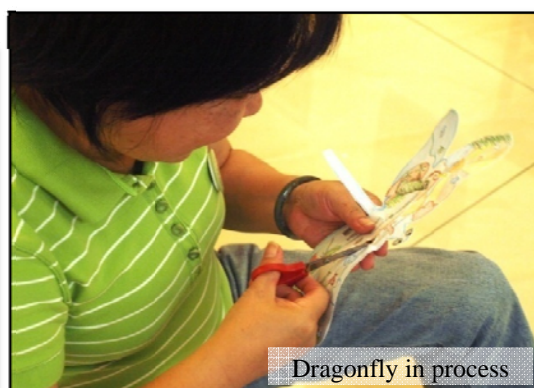
Dragonfly in process

The outcome was surprisingly good since most of the dragonfly masks looked colourful and attractive. They had done it very well indeed.