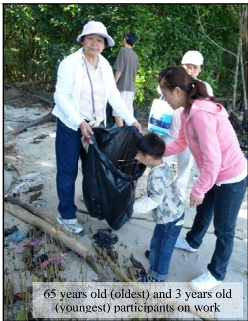
65 years old (oldest) and 3 years old (youngest) participants on work

The participants had seen all kinds of marine debris stranded along the shore during the guided tour. Thus, after enjoying the nature beauty, it was time to do some cleaning job. Every participant, no matter young or old, was dedicated to clean up the beach. Lots of non bio-degradable garbage such as plastic bags, fish nets and food packaging were found within mangrove tree roots (pneumatophores). As a result of the hard work, the participants have successfully collected 26 kg rubbish from the shore.