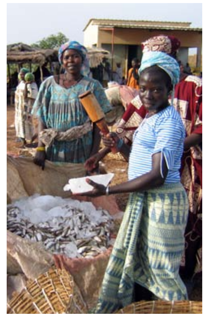
Fresh fish reach Bamako from the Seligue reservoir thanks to access to ice for storage. These women fish traders benefit by getting better prices for their product, Mali, Africa

Fig 1 illustrates the CRP's intent to identify existing constraints in AAS, develop theories of change to address them, and use these to define RinD priorities in order to move AAS dependent people from positions of asset and income poverty, vulnerability and marginalization to conditions in which they can build income and assets, are resilient and adaptive, and assured of their social, political and economic rights. Gender transformative approaches cross cut all of these efforts, informing both a specific CRP research theme on gender equity as well as the work of five other themes (sustainable productivity; equitable market access; resilience and adaptive capacity; policies and institutions; and innovation and learning). This two-pronged approach responds to learning from past women in development (WID) and gender and development (GAD) practice which identified shortfalls in both relying on separate programs for women, which remained small scale and out of the mainstream of development, and in past efforts at gender mainstreaming which tended to scatter gender concerns and resources across a multitude of interventions, diluting their critical substance and making implementation as well as monitoring, evaluation and impact assessment difficult.2